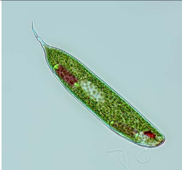
Euglena 40x objective

Make drawings representing the two microscope images below, labelling the drawing to describe the important features that you can see .